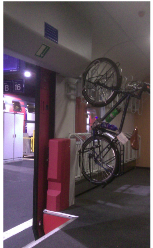
Tysk regionaltog, vertikal ophængning, forskudt højde med større kompaktthed og kapacitet. Cykler i begge sider, ikke vist på billede.