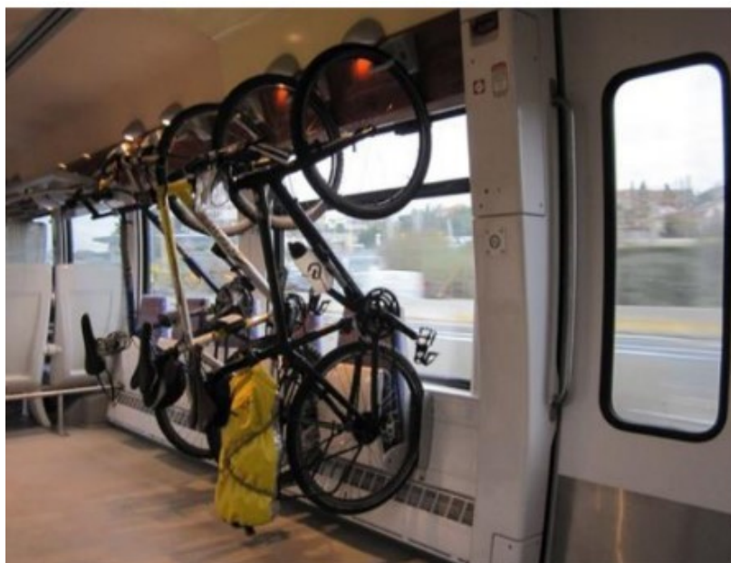
Figure 1: Vertical placement

A new French rail company “Railcoop” did a study among cyclists in order to know which solution was the most adapted and appreciated. In the table below, you have the grades attributed to each type of hook. As you can see, vertical placement is not the more plebiscited for the reasons we evoked.