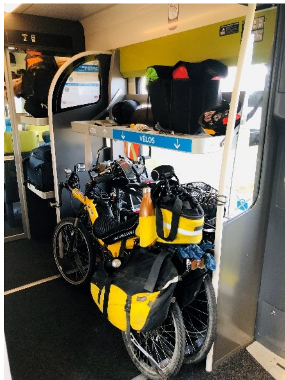
Figure 3: Side to side