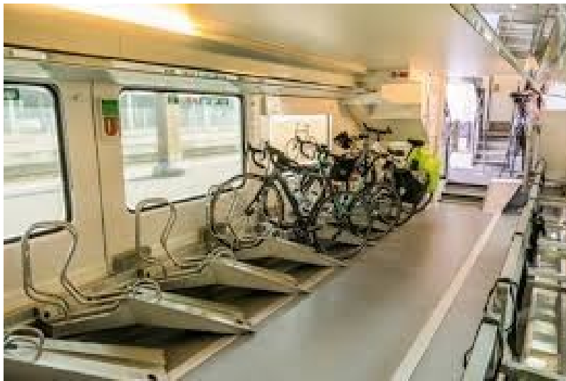
Figure 2: Herringbone parking

The solution preferred by most cyclists is herringbone parking. Indeed, it allows a large number of bicycles to be accommodated, it is easy to move around with your bicycle on the train, and there is no risk of damaging the bicycle.